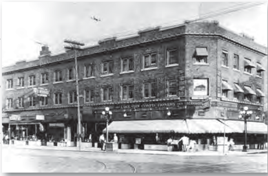
The Geanakoplos Building with Lakeview Confectionery