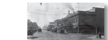
15 2900 HENNEPIN AVENUE: THE UPTOWN THEATER