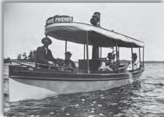
Courtesy of Marilyn F. Klein, Granddaughter of Alexander Shepherd (1899)

Restaurants, fashionable theaters, top notch entertainment facilities, and unique retail shops were interspersed with everyday services, and public schools and libraries opened up to meet the needs of the growing community. In 1929, when local businessmen began to use the name "Uptown" to describe the area, Hennepin and Lake was solidly ensconced as the major shopping and entertainment district outside downtown.