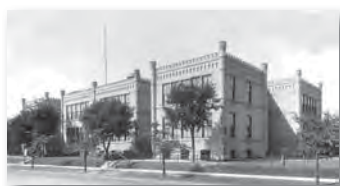
4 3016 GIRARD AVENUE SOUTH: CALHOUN SCHOOL