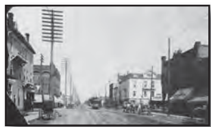
7 LYNDALE AVENUE AND LAKE STREET/ CROWELL BUILDING