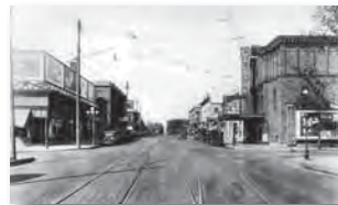
5 1400 WEST LAKE: THE CALHOUN THEATER/UPTOWN BALLROOM