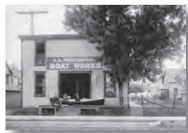
14 1113 WEST LAKE: A.L. SHEPHERD BOAT WORKS