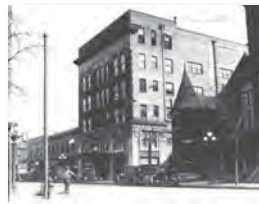
11 711 WEST LAKE STREET: THE CALHOUN STATE BANK BUILDING