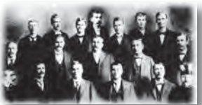
19 1455 WEST LAKE STREET: SONS OF NORWAY