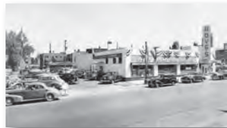
1 1450 WEST LAKE STREET: HOVE'S / LUNDS