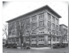
6 1006 WEST LAKE: THE BUZZA BUILDING