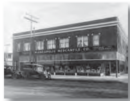
12 925 WEST LAKE STREET: THE MINNEAPOLIS MERCANTILE COMPANY