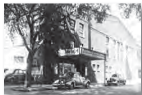
13 2900 SOUTH DUPONT AVENUE: MINNEAPOLIS ARENA