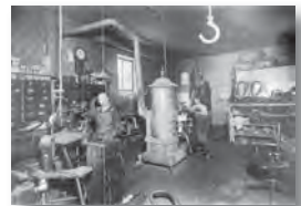
8 609 WEST LAKE STREET: SCHATZLEIN SADDLE SHOP