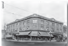
3 2924 HENNEPIN AVENUE: ABDALLAH'S