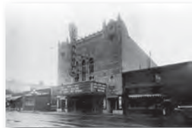
2 3022 HENNEPIN AVENUE: THE GRANADA THEATER