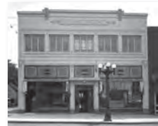
17 2919 HENNEPIN AVENUE: SCHLAMPP & SONS FURRIERS