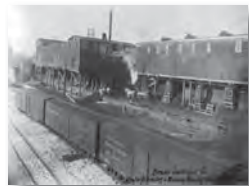
10 GRADE SEPARATION PROJECT (1912-16)