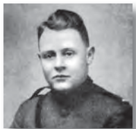
9 2916 LYNDALE AVENUE: JAMES J. BALLENTINE VFW POST 246