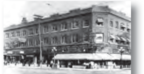
18 HENNEPIN AVENUE AND LAKE STREET/UPTOWN